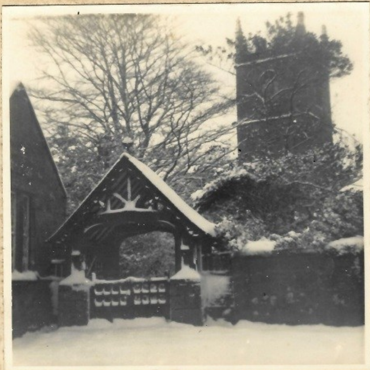
ST EARTH PARISH CHURCH