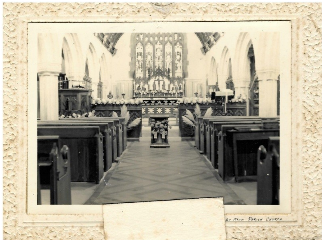
ST. ERTH PARISH CHURCH

With Sincere Christmas Greetings and Good Wishes for Every Happiness in the New Year from