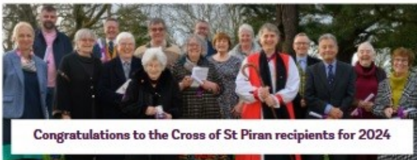
Congratulations to the Cross of St Piran recipients for 2024